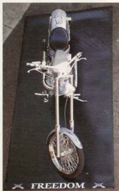
The 10 x 5-foot mat is large enough for the longest choppers.