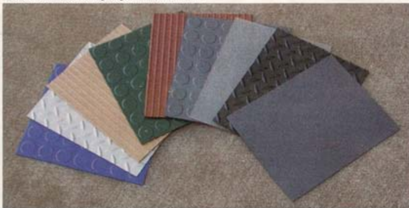
Some samples of the roll-out flooring shows the variety of surfaces and colors available.