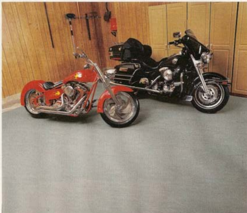
Who wouldn't want a garage as clean as this?

The peel and stick tiles (available in either 12 or 24 inches) are another option. The tiles should be stored for 48 hours at room temperature of at least 65 degrees. Looking at the garage floor as a rectangle, find the center point of all the walls and make a mark. Using the unpeeled tiles, lay out your pattern and measure and mark to